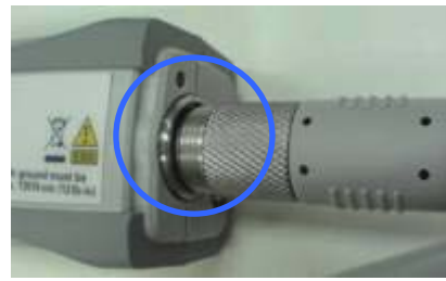
Figure 2: USB power sensor cable not fully attached to power sensor unit