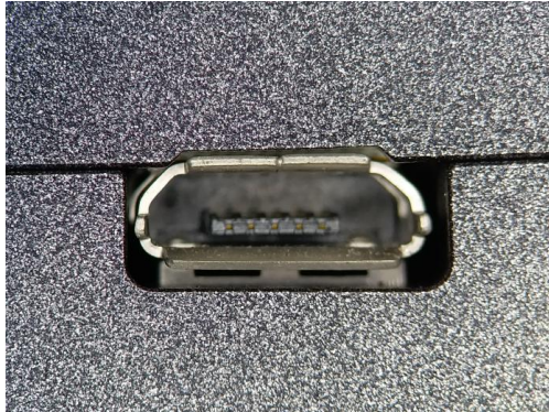
With Secure Block

If a rework has already been done, it can easily be identified by looking at the USB connector, refer to the image below.