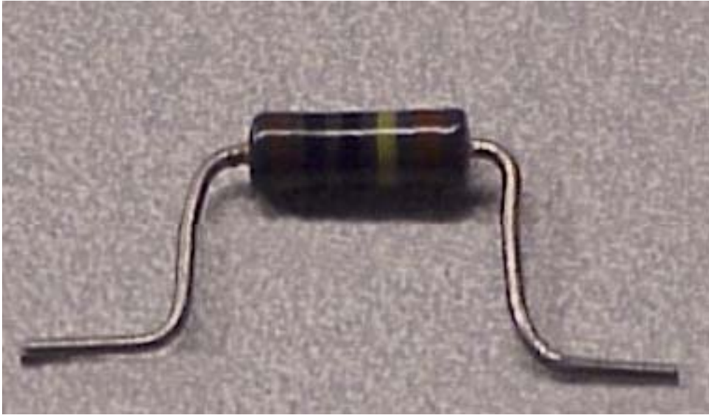
Figure 3. Demonstration of adjusting leads of the 1Mohm bleeder resistor

Adjust the leads of the 1Mohm bleeder resistor until it looks similar to Figure 3.