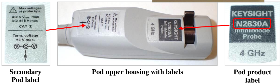
Secondary Pod label

Align and attach the Pod product label onto the Pod upper housing.