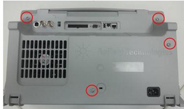
New revision cabinet