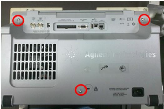
Old revision cabinet