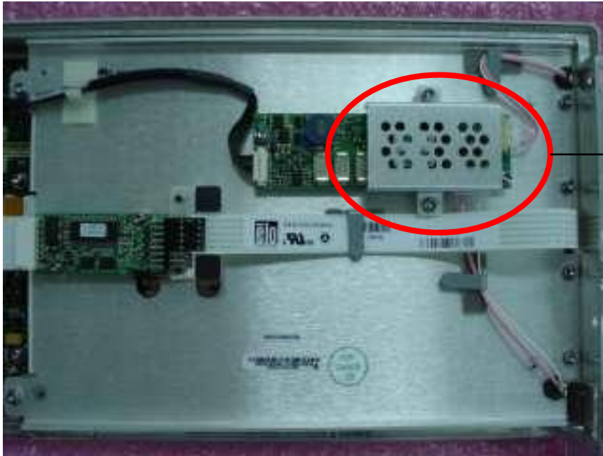
Figure 1: Old inverter shield N5230-00013

9. Loosen the two screws on the inverter shield shown in Figure 2, using a T-10 wrench.