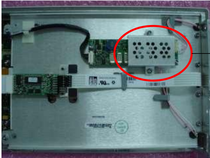
Figure 1: Old inverter shield N5230-00013

9. Loosen the two screws on the inverter shield shown in Figure 2, using a T-10 wrench.