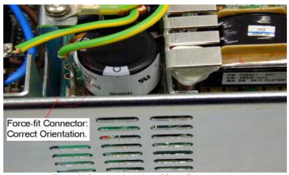
Figure 3: Correct orientation of force-fit connector.

Ensure that this connector is re-fitted such that the bottom (flat) side of it is facing the large capacitor on the Power Supply Unit, P/N: 0950-3681.