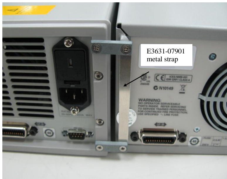
Figure 5: Rear view rear lock link secured with metal straps kit for side-by-side rack mounting

Use metal strap (part number E3631-07901), and stack the provided two metal straps together to form 3mm thickness and secure it with the provided screws on the rear lock link as shown in Figure 5 below.