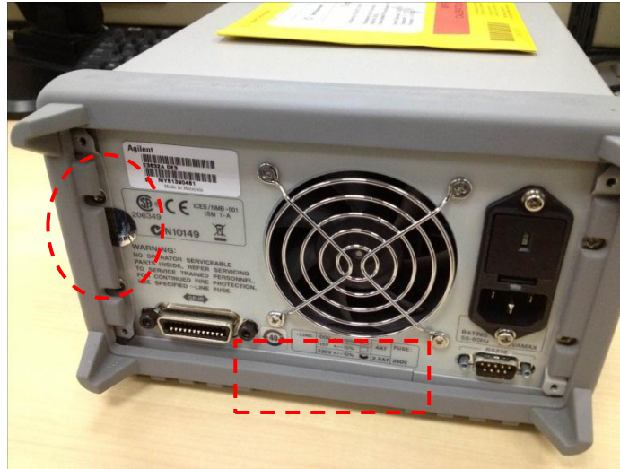
Figure 1: Loose rear bumper – gap observed between bumper and chassis

There is a new rear bumper design starting from serial number MY51240078. The rear bumper may become loose or it may slip out of the instrument chassis when force is applied to the rear bumper, as shown in Figure 1 below.