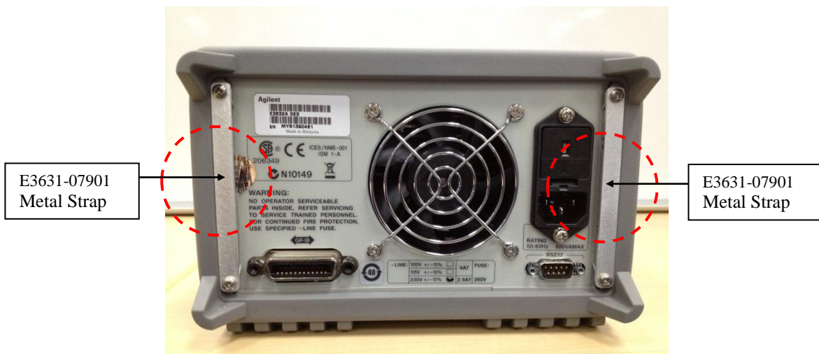
Figure 3: Secure with metal straps – no gap observed between the bumper and chassis

Use two metal straps (part number E3631-07901) to secure each side of the bumper as shown in Figure 3 below.