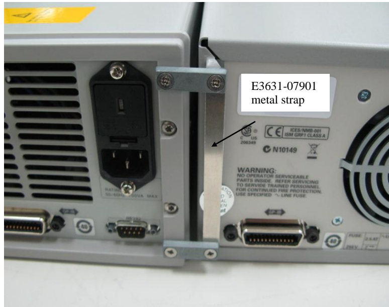
Figure 4: Rear view rear lock link secured with metal straps kit for side-by-side rack mounting

Use metal strap (part number E3631-07901), and stack the provided two metal straps together to form 3mm thickness and secure it with the provided screws on the rear lock link as shown in Figure 4 below.