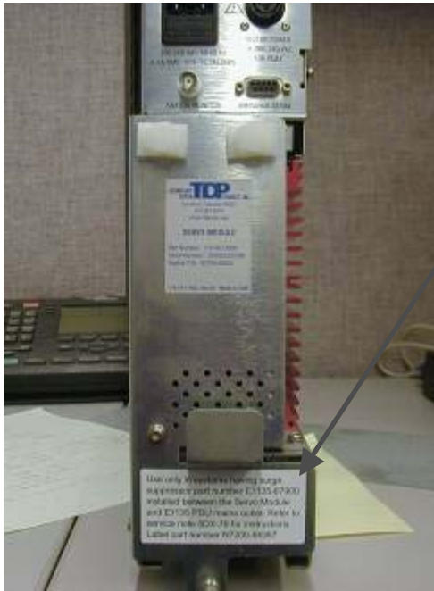
Figure 4: Installed N7200-84367