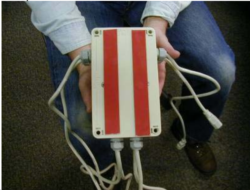
Figure 2: Bottom of Suppressor Showing Covered Two Sided Tape