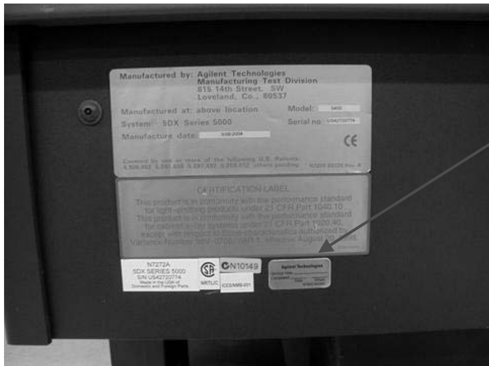
Figure 6: Detailed view of N7200-84366 service note label installed at lower right of label area

Note: The N7200-84366 label located to the lower right of the existing labels in the photo below.