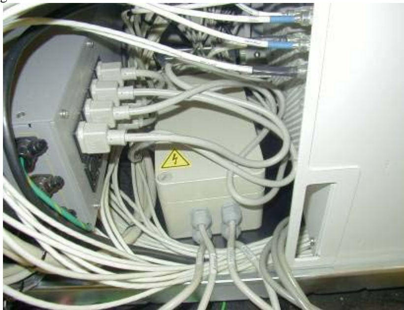
Figure 3: Installed Surge Suppressor Unit