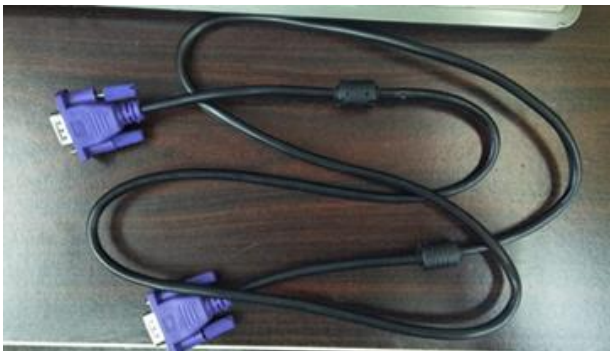
Figure 1: Existing VGA Cable (0960-3615)

The VGA cable (Keysight Part Number: 0960-3615) shown in Figure 1 below may cause Display Smearing/Shadow/Double image/Rolling Effect issues (Figure 2) on the In-Circuit System with Serial Number listed in this Service Note. This is due to the quality of the VGA cable batch bundled by Hewlett Package.