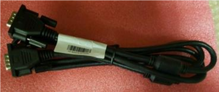
Figure 3a: new VGA cable KPN: 8121-3377