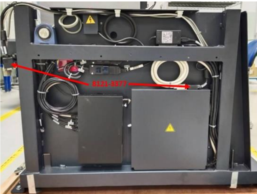
Figure 3b: Location of the VGA cable to replace