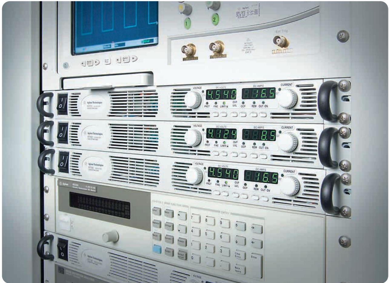
Figure 2. Stacked “True 1U” design

applications where many, sometimes dozens, of power supplies may be used to provide power to single or multiple test points over long periods of time to weed out early failures.