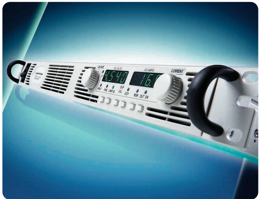
Figure 1. Agilent Technologies N5700 750 W or 1500 W power supply

Programmable system DC power supplies in the 500 W to 2 kW power range are used in a variety of industries such as automotive, aerospace/defense, telecom, and component test. Applications using these sources include testing of control modules for cars and aircraft, satellite heaters, and base station amplifiers, as well as burn-in of devices such as laser diodes and memory chips. In an effort to reduce both the cost of test system development and the actual cost of test itself, test engineers in these industries are demanding more power in less space, faster programming and response time, and more flexible power supplies. System DC power supply manufacturers have responded by providing smaller, faster, and more capable sources.