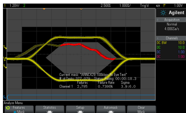
Figure 2: Pass/fail masks based on industry specifications can be created on a PC and then downloaded to the scope.

Another method is to import a multi-region mask that has been previously created on a PC based on published standards. Figure 3 shows an example of an eye-diagram test based on an imported mask of an ARINC 429 serial bus signal which is common in the aerospace/defense industry. In this example we see that a significant number of pulses are failing the test.