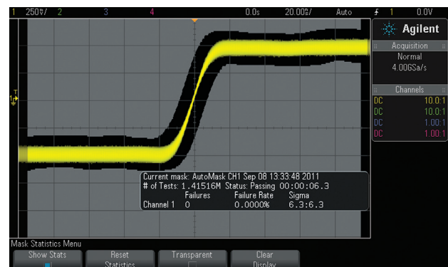
Figure 1: Mask testing can test multiple wave shape parameters at once including maximum allowable noise.

multiple characteristics of captured waveforms can be tested using a single mask. Rather than testing against a specific parameter, such as a peak-to-peak voltage, mask testing will test the overall shape of a waveform that may include Vpp, rise time, pulse width characteristics, as well as maximum allowable noise.